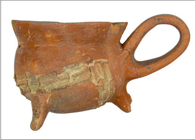
Figure 7: Tripod cup

As Mellink mentioned red-slipped barbotine ware might be a different sub-group of West Anatolian local ware that differs from further west such as Yortan etc (Mellink, 1964).