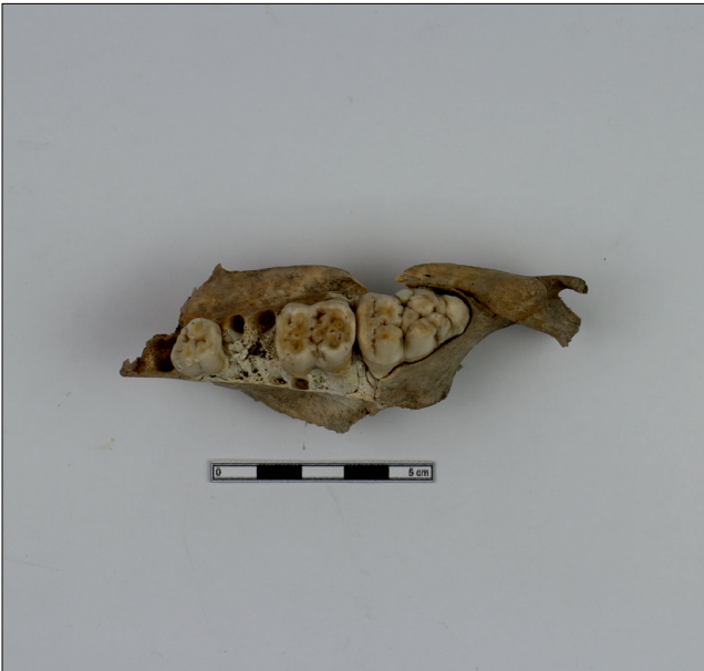
Figure 9: Maxilla of a pig