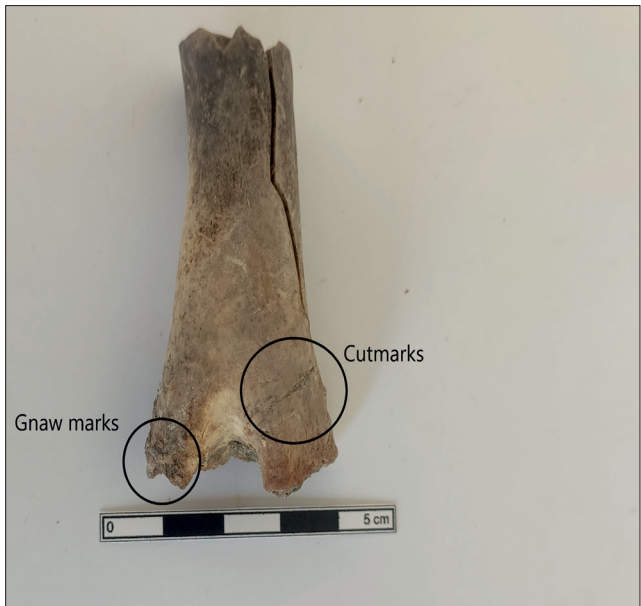
Figure 11: Humerus of a pig and gnaw marks