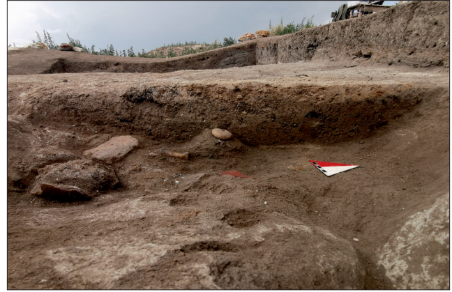
Figure 4: Profile of the pit and clay layer on top of it.

In Küllüoba, the red-coated ware was not seen before EBA III. On the other hand, the tripod cooking pot first appeared at the end of EBA II. In previous studies, the Early EBA III in Küllüoba was dated to between 2450 and 2250 BCE (Türkteki et al. 2021). The barbotine decoration on the tripod cup had been represented in different forms in Küllüoba since the beginning of the Early Bronze Age (Efe & Ay Efe, 2000). This kind of decoration in combination with reserve slip ware is also known from the contemporary settlements of Küllüoba such as the example from Elmalı-Karataş (Mellink, 1964, 276-7, Fig.28) (Eslick, 2009). However, the tripod cup form with handles was not found before (Fig. 5-7).