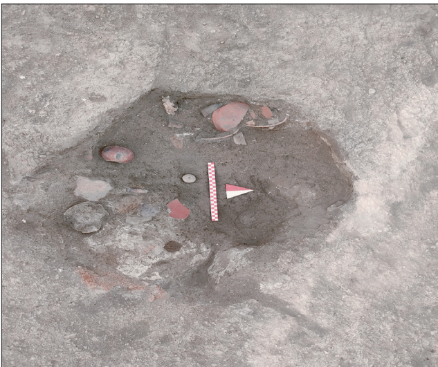
Figure 5: Pit no 35 within it's findings during the excavation

Among the pottery recovered from the pit, the pottery forms represented by the leg fragment of a tripod cooking pot, the red-coated ware bowl and the tripod cup suggest that the pit must be dated to Early EBA III.