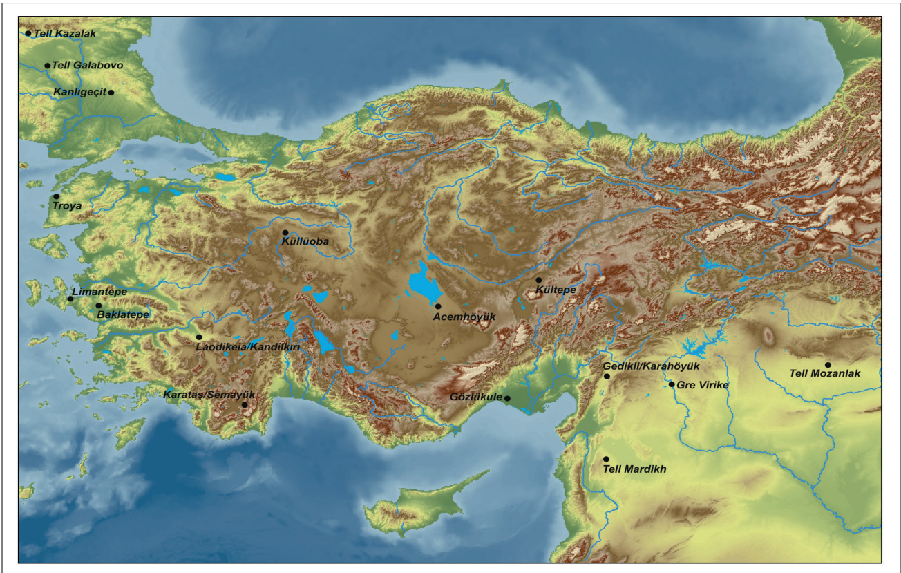
Figure 1: Sites mentioned in text

Different pit practices are known from the Neolithic period that also continued in the Ubaid period in Anatolia and its surrounding areas (Arimura, 2000; Esin, 1987). Various examples dating back to the Neolithic and later periods are commonly observed in the Marmara region and the Balkans (Özdoğan et al., 2008) (Karamurat, 2018). Especially in the Balkans, some areas were reserved only for pits (Nikolov, 2011)(Nikolov, 2015).