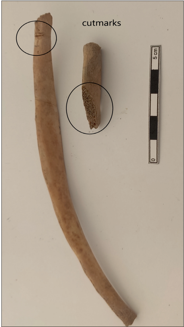
Figure 10: Cutmarks on the rib bones