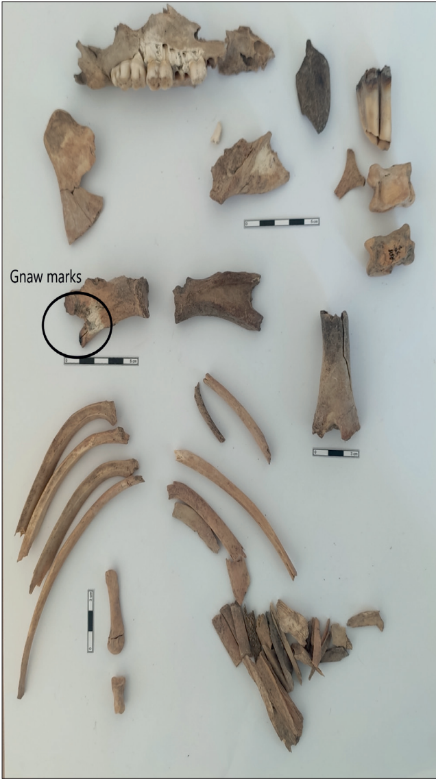
Figure 8: Animal bones from pit no 35