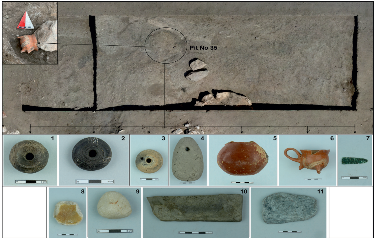
Figure 2: Pit no 35 and it's findings

Examples of pit practices before EBA were found in Proxynas, Greece, in relation to the burial area (Psimogiannou, 2012). Afterwards, it is known that there are votive pits in the Blue phase (Cultraro, 2013) and the Red phase in Poliochni (Kouka, 2011).