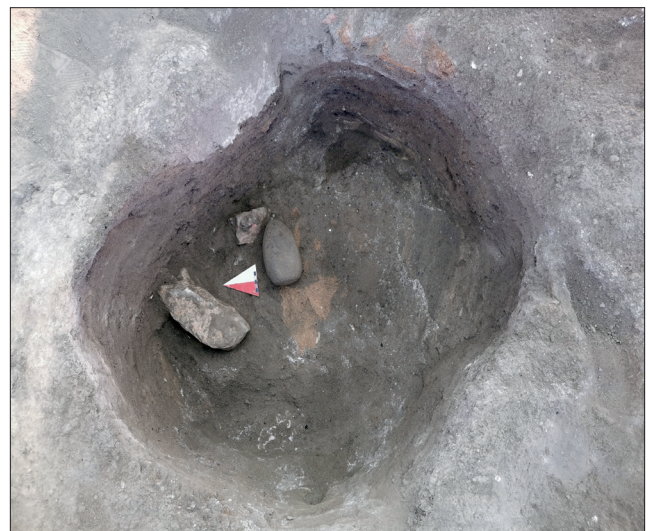
Figure 6: Findings on the floor of pit no 35

Although it looks like a tankard, the said vessel is identified as a cup due to its legs. It could be considered unique in this context since it has no direct parallel in Anatolia as far as we know. The fact that features of different pottery forms such as barbotine decoration, tankard, tripod vessel, and loop-handled bowl are used together on the same vessel and thus create somewhat a mixed form should be seen, just like the abovementioned pit phenomenon which spread over a large geographical area, as a reflection of interregional relations.