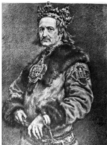
FIG. 35—WŁADYSŁAW JAGIEŁŁO (1386-1434)