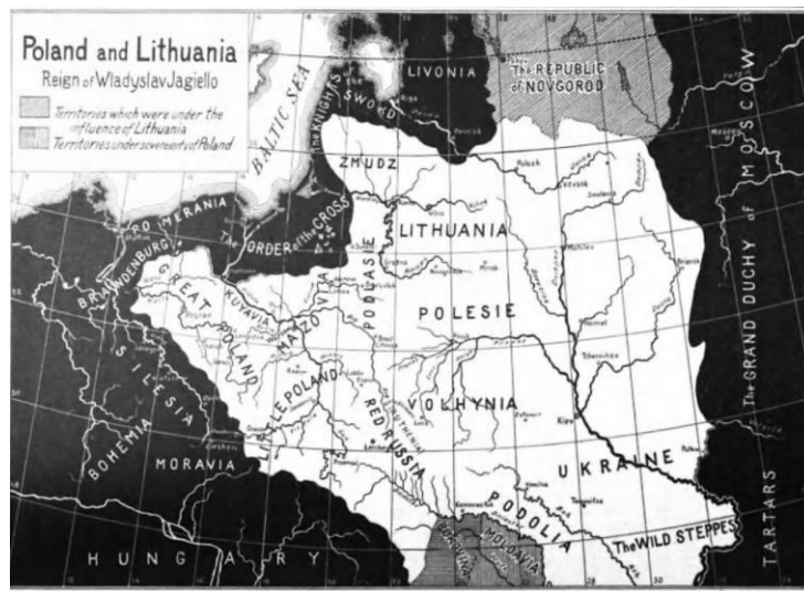
Territories of the Polish-Lithuanian Union Under the Reign of Jagiełło 67

Since 1362, in less than a hundred year Lithuania got quadrupled its territory in terms of its raids and triumphs. But, because of it consisted mainly Christian Slav population, ordering those lands were not only so difficult, caused Lithuanians confrontation with the Tartars and the Teutons as well. Furthermore, having a longer border to Russian Principalities, Poland attacked to the part of Mazovia 65 in the Lithuanian lands. When Jagiello ascended to the throne, the situation of country was as mentioned above and Lithuania urgently needed an ally against its opponents. 66